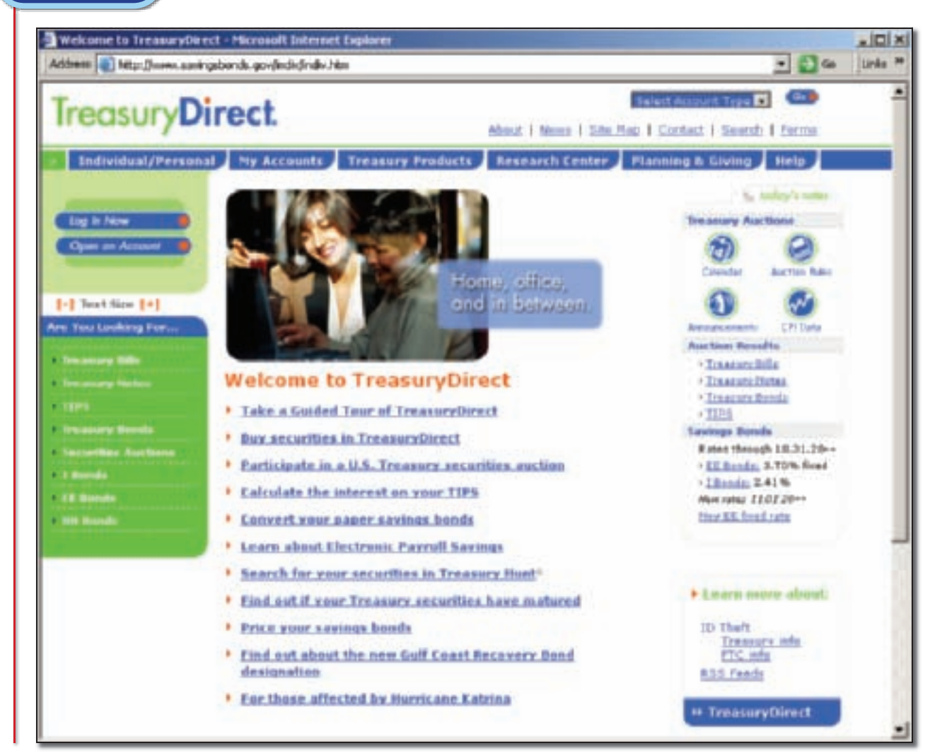
■ Direct from the Treasury Department Individuals, institutions, and government agencies can buy U.S. bonds over the Internet. Why might a government agency want to buy bonds?

Treasury Bills Treasury bills are sold in units of $1,000. They may reach maturity in four, 13, or 26 weeks. T-bills are discounted securities, which means the purchase price that investors pay is less than the face value of the T-bill. On the maturity date, the investor receives the full face value of the T-bill.